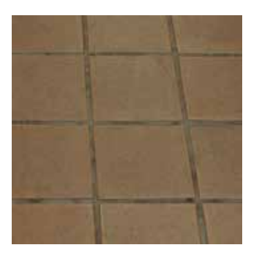
Heavily soiled floor and grout lines before cleaning with a TURFSCRUB™ floor pad.