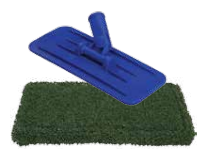
Also available in 4.5" x 10" size for use on utility pad holders.