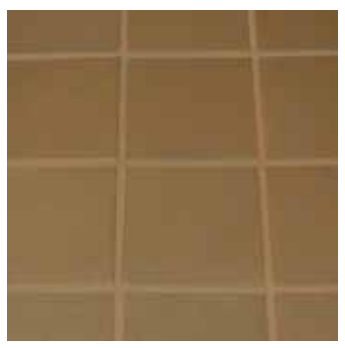
Floor surface, including grout lines, are sparkling clean after scrubbing with a TURFSCRUB™ floor pad.